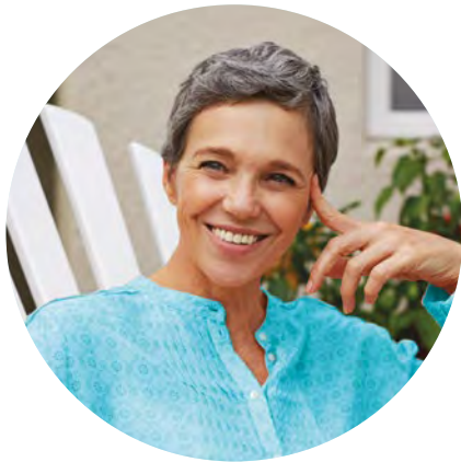
Hypothetical example. Not an actual case.

Fixed annuity with guaranteed lifetime withdrawal benefit